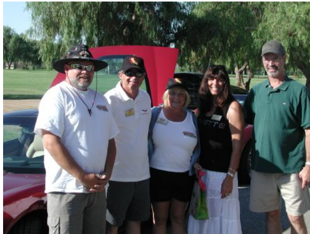
Our CSS Family