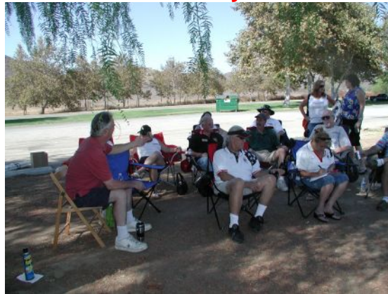
Relaxing after the Rally