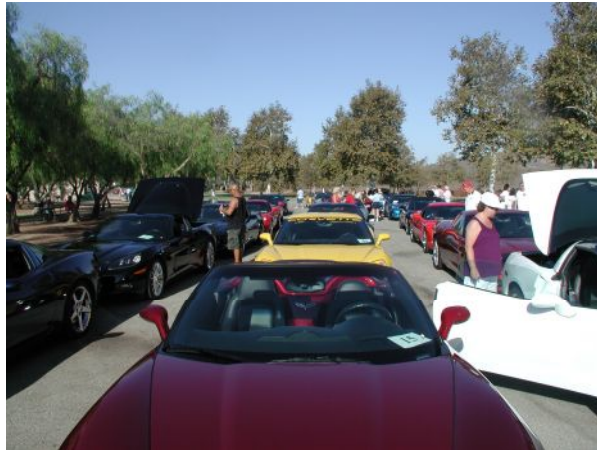
Attendees of the Rally