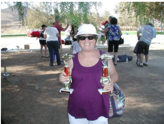
SURPRISE 6 TH PLACE – RALLY