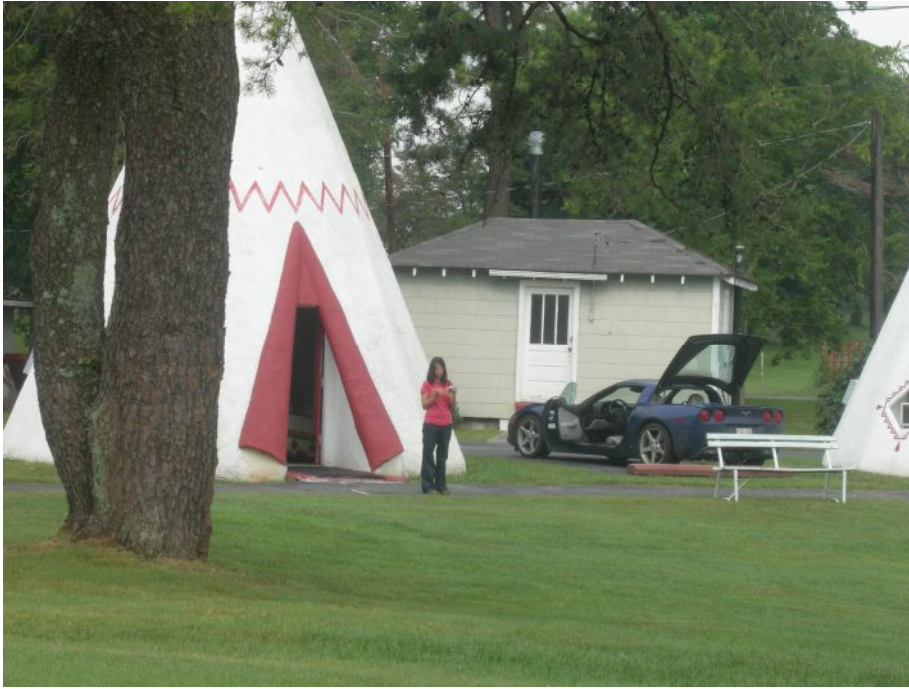
Above is the Cave City Wigwam Hotel