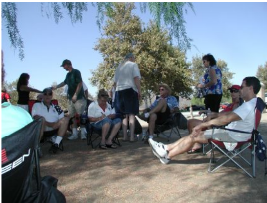
Relaxing after the Rally